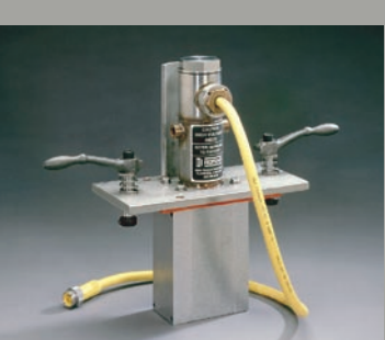
Scintillation Detectors: • 50 mm General Purpose Detector • 60 mm Water Cooled Detector Detectors Mount either Inside or External to the Mold Water Jacket