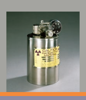
GS- 200/300 Point or Strip Source Holder with Internal Rotary Shutter. Mounts either External or Internal to Mold