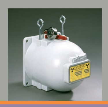
SA-1 Ductile Iron Point Source Holder with Internal Rotary Shutter. Mounts External to Mold

For mills where the user is already using gamma technology, Ronan offers a cost-effective solution to upgrade to this latest technology while utilizing existing sources, irrespective of original manufacturer. In cases where the user has a large inventory of detectors, solutions are available where those can still be used, thus increasing the cost-effectiveness of upgrading.